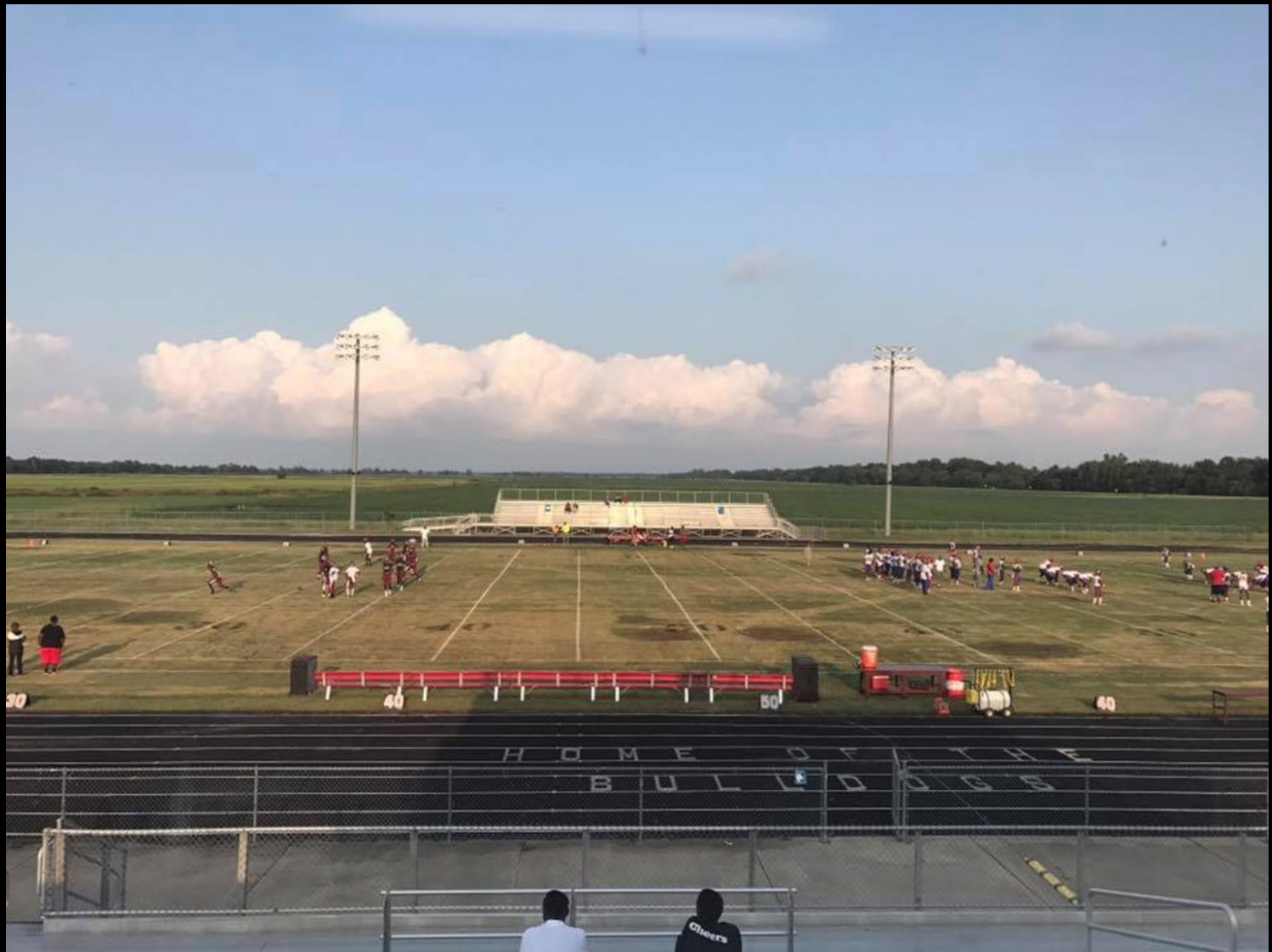
Earle High School