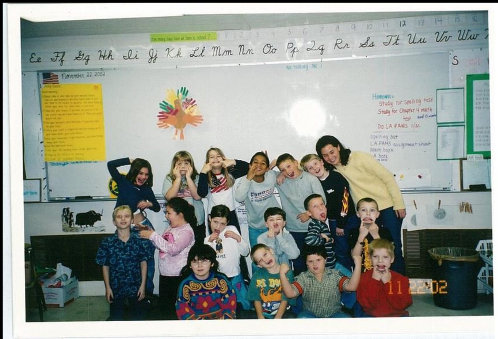
1 st class, fall 2002, Vanleer Elementary School