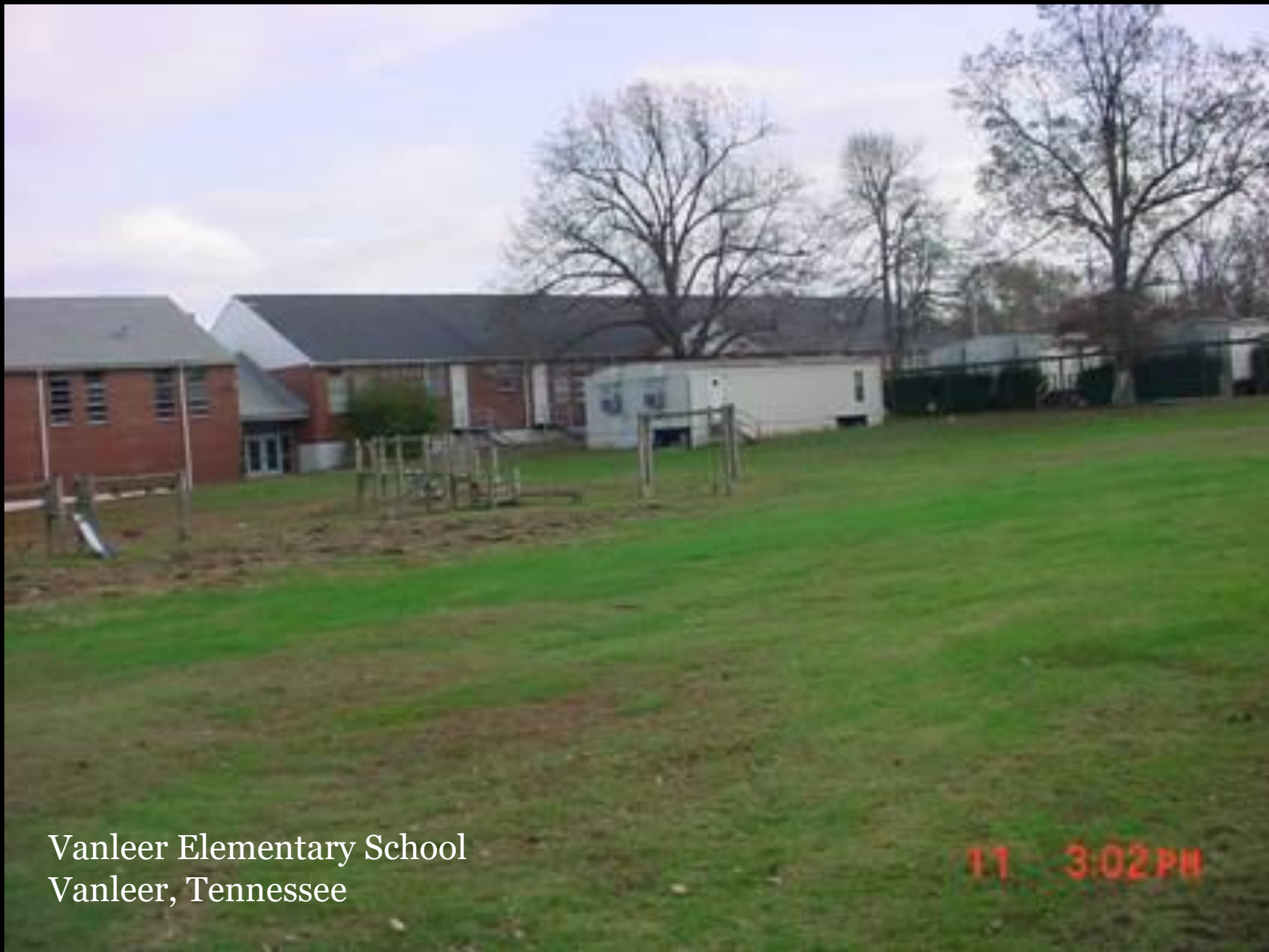
Vanleer Elementary School Vanleer, Tennessee