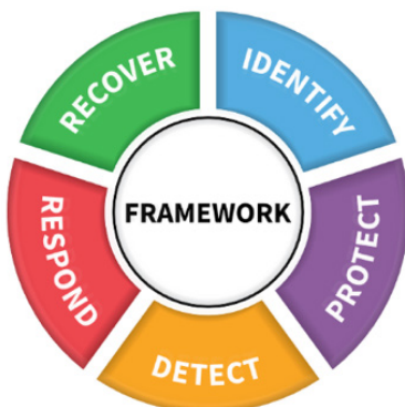
Figure 1: NIST Framework

The U.S. Secret Service has extensive experience in cyber IR and the subsequent criminal investigations, and we offer this guide outlining basic steps an organization can take before, during, and after a cyber incident. This guide is built upon an in-depth analysis of the methods and tools used to identify, locate and arrest significant cybercriminals, the industry technical framework of the National Institute of Standards and Technology (NIST), and the legal framework of the Department of Justice.